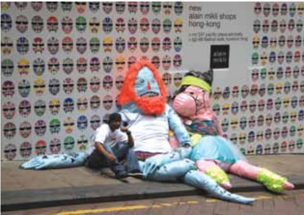
Fig. 7. The Fat Face and Old Man by Graphic Airlines, Lan Kwai Fong, Hong Kong, 11 May 2008.