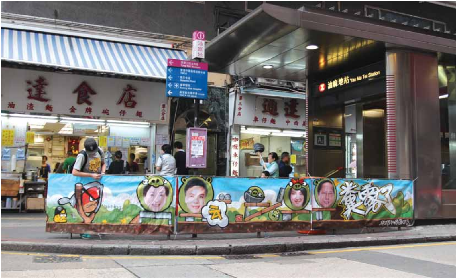
Fig. 4. Three banners by graffiti artist, Yau Ma Tei, Hong Kong, 21 March 2013.

if more people arrived at the beach wanting to relax, he might need to ask them to stop and leave. During the afternoon more visitors came to the beach, but the feedback from them and the cleaners of the beach was only positive. People stopped to admire the creation process, the colors and the composition of the work. Because of the off-season timing and remote location, this experiment was possible and successful. In addition, the fact that the cellophane was not wrapped around any trees or lampposts but was on a removable frame, and that the artists covered the sand to protect it from the paint, had a positive impact on citizens and officials alike. In this project, the interaction of the format, behaviour and site made the project successful. Whether the cellograffing could be used in any other space, time and framing in Hong Kong or other Chinese cities remains an open question.