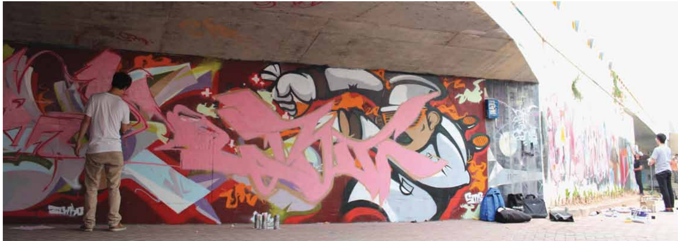
Fig. 9. Shenzhen, 25 March 2013.

close to Argyle Street in Hong Kong. 10 I define these sites as semi-legal, because being at the site itself is not illegal, as it is at the abandoned premises. More importantly, creating on these walls has usually been allowed to happen without official intervention or consequences.