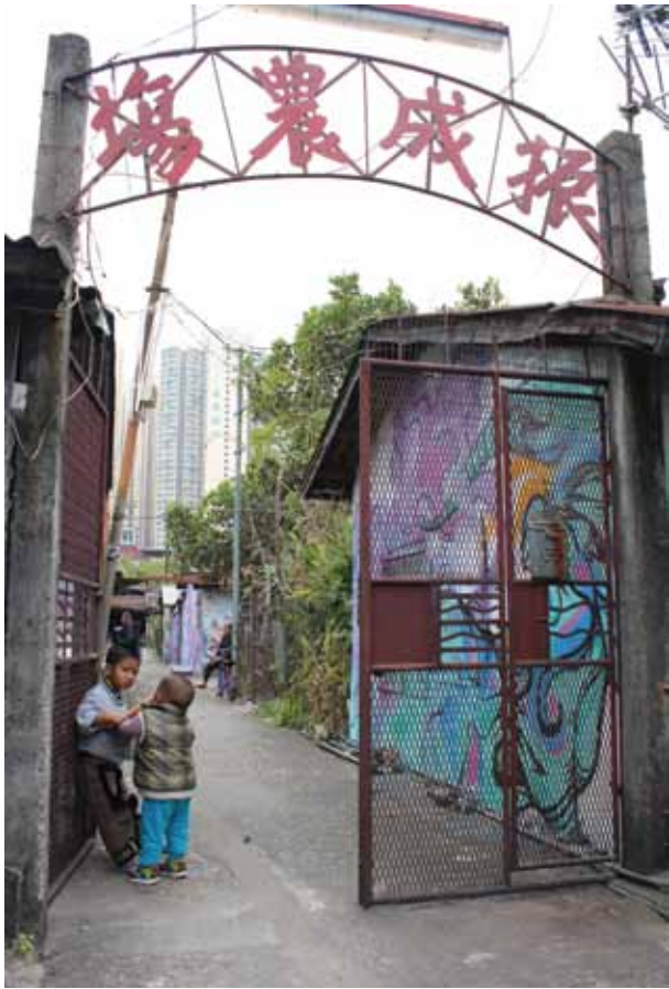
Fig. 11. Lam Tei village, Hong Kong, 3 March 2013.