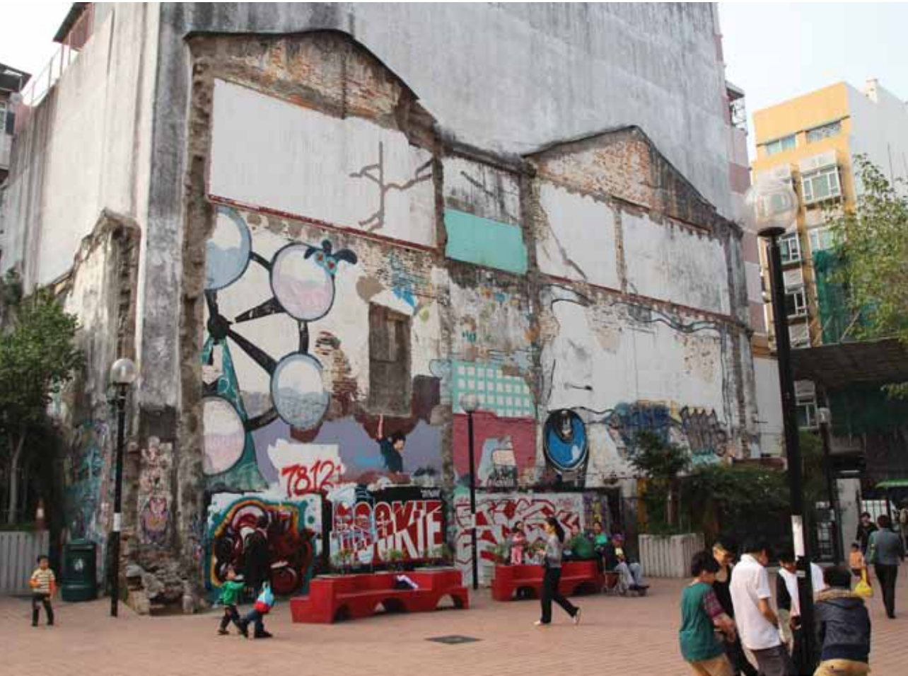
Fig. 10. Park along the Rua dos Mercadores, Macao, 22 March 2013.

Another legal form of collaboration, besides the urban art images commissioned by private citizens, entrepreneurs and companies, is provided by the representatives of governmental offices, youth associations, rehabilitation centres, schools and universities. A growing number of institutions in Hong Kong have been developing projects that could encourage creativity and add colour to the