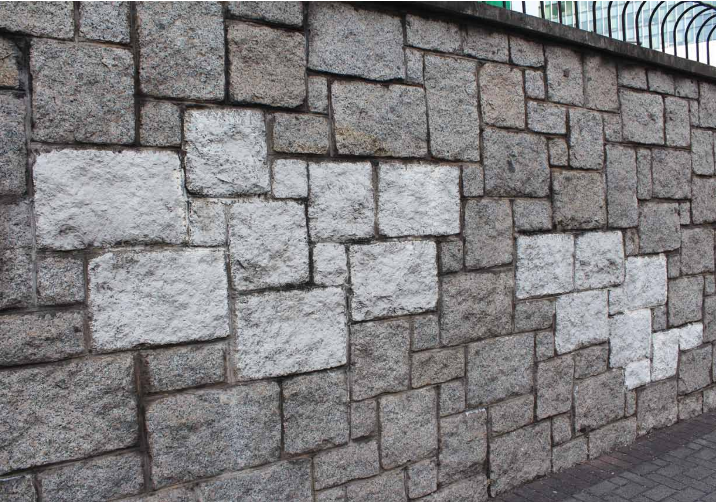
Fig. 1.White squares at Harcourt Road, Hong Kong, 5 March 2013.

The understanding of the levels of illegality can be challenged by the creators of urban art images through four main variables, namely the format and the content of the works, the behaviour and the choice of the site. Often these four variables are interdependent and have an impact on each other. Preconditions for a site and time, for instance, vary according to the format implied: to create a multi-coloured piece could take hours while creating a throw-up or putting up a sticker or a poster can be handled in a matter of seconds or minutes. Nonetheless, I start the discussion by focusing on the issues of format , by which I denote the materials and techniques, and the content of the work, including the composition, style and visual elements, in relation to forms of behaviour . The selection of the site is a complex process that can be divided into two main trends: initiated by the creators themselves or by some other actors of the scene. Because the choices of sites in terms of semi-il/legal approaches require more detailed discussion based roughly on this dichotomy of agency, I will elaborate this intriguing issue in two subchapters in the latter part of this article.