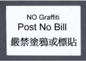
Fig. 2. An official sticker, Hong Kong, 3 March 2013.

since autumn 2012 by a local graffiti artist who wishes to remain anonymous. The official bilingual sticker, which can be found in public spaces in Hong Kong, cautions against creating graffiti and putting up any kind of notices. The version created by the graffiti artist is identifiable by the wordplay both in English and in Chinese. In the English reworking, two words are changed, which consequently transfers the sentence from denial to a suggestion: Know graffiti, Post Ur Bill . In Chinese, a slightly more complex pun is achieved by changing only the first character from yan 嚴 to bu 不. The official version strictly forbids graffiti while the new version has two meanings: graffiti is not prohibited and one cannot refrain from doing graffiti (Figs. 2 and 3).