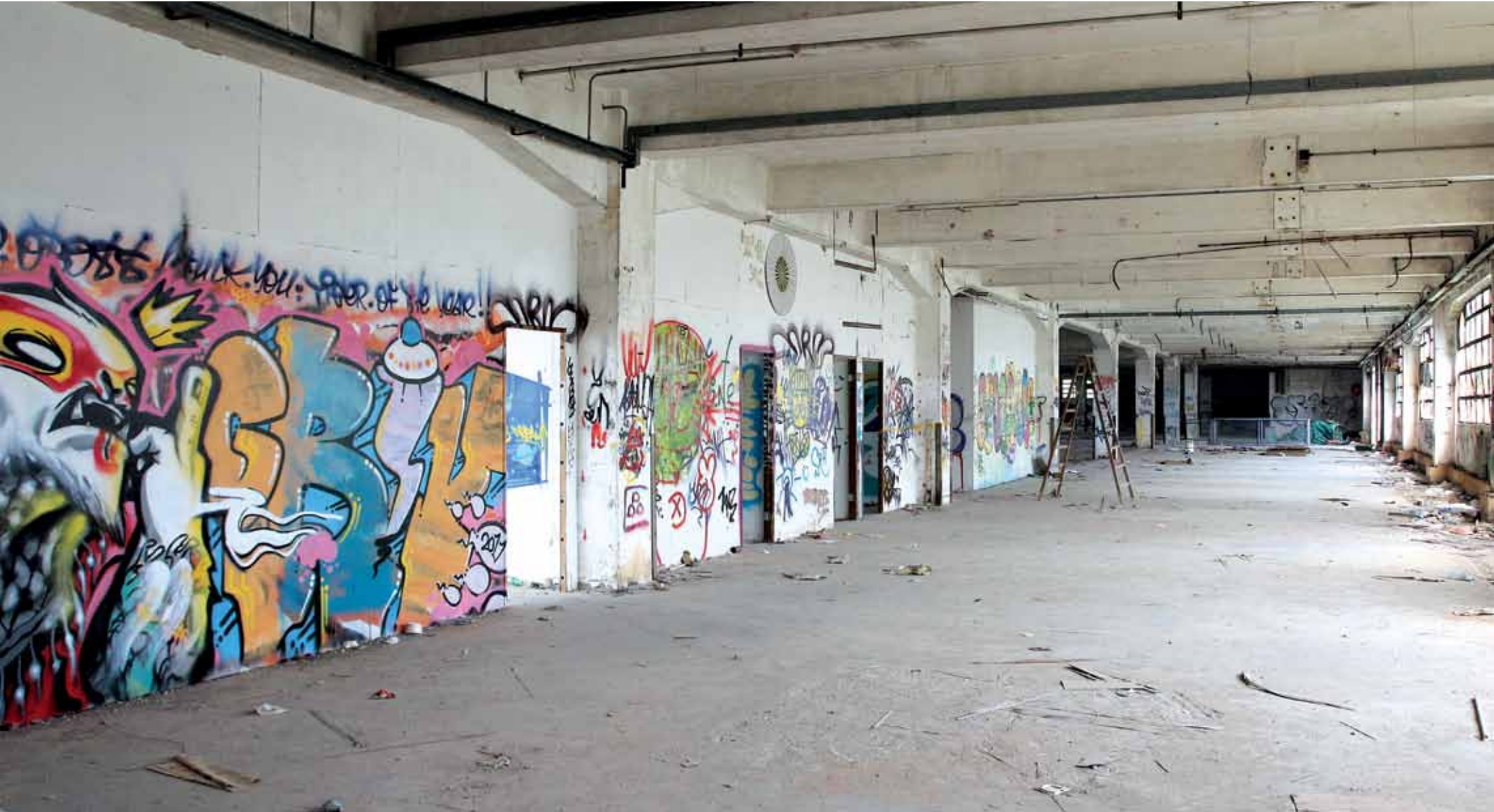
Fig. 8. The ATV studios, Sai Kung, Hong Kong, 9 March 2013.

Instead of demolition sites, the creators also look for walls in the more open public areas in the cities. Roughly speaking, creative actions are usually more accepted on the outskirts than in the city centre. But this too, depends on the city in question. The most famous semi-legal walls where creating urban art images is—or has been—tolerated in mainland China and in Hong Kong are the 798 art district (798 艺术区) in Beijing, Moganshan Road (莫干山路) in Shanghai, the longest wall of fame close by the Honghu West Road (洪湖西路) in Shenzhen and the Mong Kok Alley