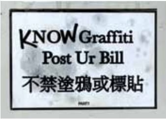
Fig. 3. A sticker by graffiti artist, Hong Kong, 18 February 2013.

The third, far more visible but intriguingly unnoticed new format is a creative modification of banners that advertise the representatives of Hong Kong Special Administrative Region (HKSAR) and are draped on the railings around the streets of Hong Kong. In an interview on 10 March 2013, the local graffiti artist, who prefers to stay unnamed, explained how he has during the past two years borrowed the banners for visual recreation. In his studio, he re-paints the banners partially with spray paints. Originally, he chose colours matching the original design and painted the banners only partially, but gradually he has shifted to more visible elements that almost fill the whole banner. For this latest set, created in March 2013, the graffiti artist chose to refer to a popular mobile game, Angry Birds , because he wanted to emphasise his dissatisfaction with three issues: the inability of people to pay attention to the details in their everyday surroundings, the current political system in Hong Kong and the growing occupation of public space for political advertisement through the banners. The graffiti artist wishes to question the usage of the public space and who can employ it for which purposes. Why are graffiti and street art regarded as vandalism while the political banners and other forms of advertisement are not? After all, these ‘accepted’ forms are filling up public space, which originally belonged to people. And they are not making it any more appealing