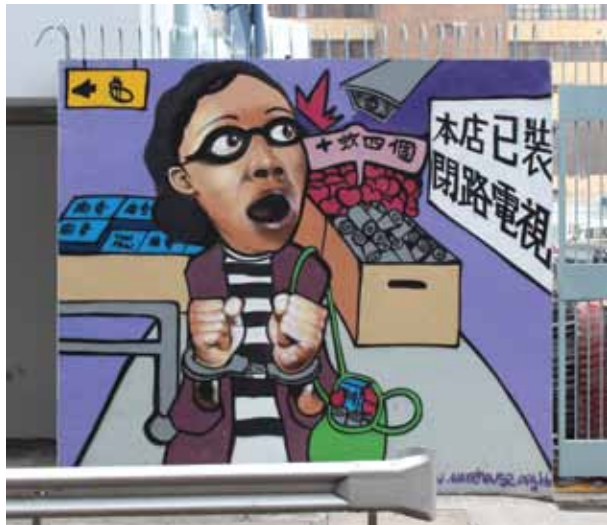
Fig. 13. Tuen Mun Police Station, Hong Kong, 29 March 2013.

artist UnCle, decided to invite other local creators, such as KS, Jams, Devil and Fuck Da Cops (FDC) as well as from the GANTZ 5 crew from Macao to join. Altogether 13 creators participated in the project over two months. The police had set up three main themes for the main walls, namely celebration of the Beijing Olympics, crime prevention and anti-drugs activities. (UnCle, graffiti artist, Hong Kong, email 30 March 2013). Despite the scrutinised creation process, both UnCle and the other local crew, FDC, managed to paint their own names on the walls of the station (UnCle, graffiti artist, Hong Kong, email 30 March 2013; KDG, graffiti writer, Hong Kong, interview 25 March 2013). FDC used a very abstract design, but nonetheless putting their crew name on the police station added a somewhat ironic twist to the project.