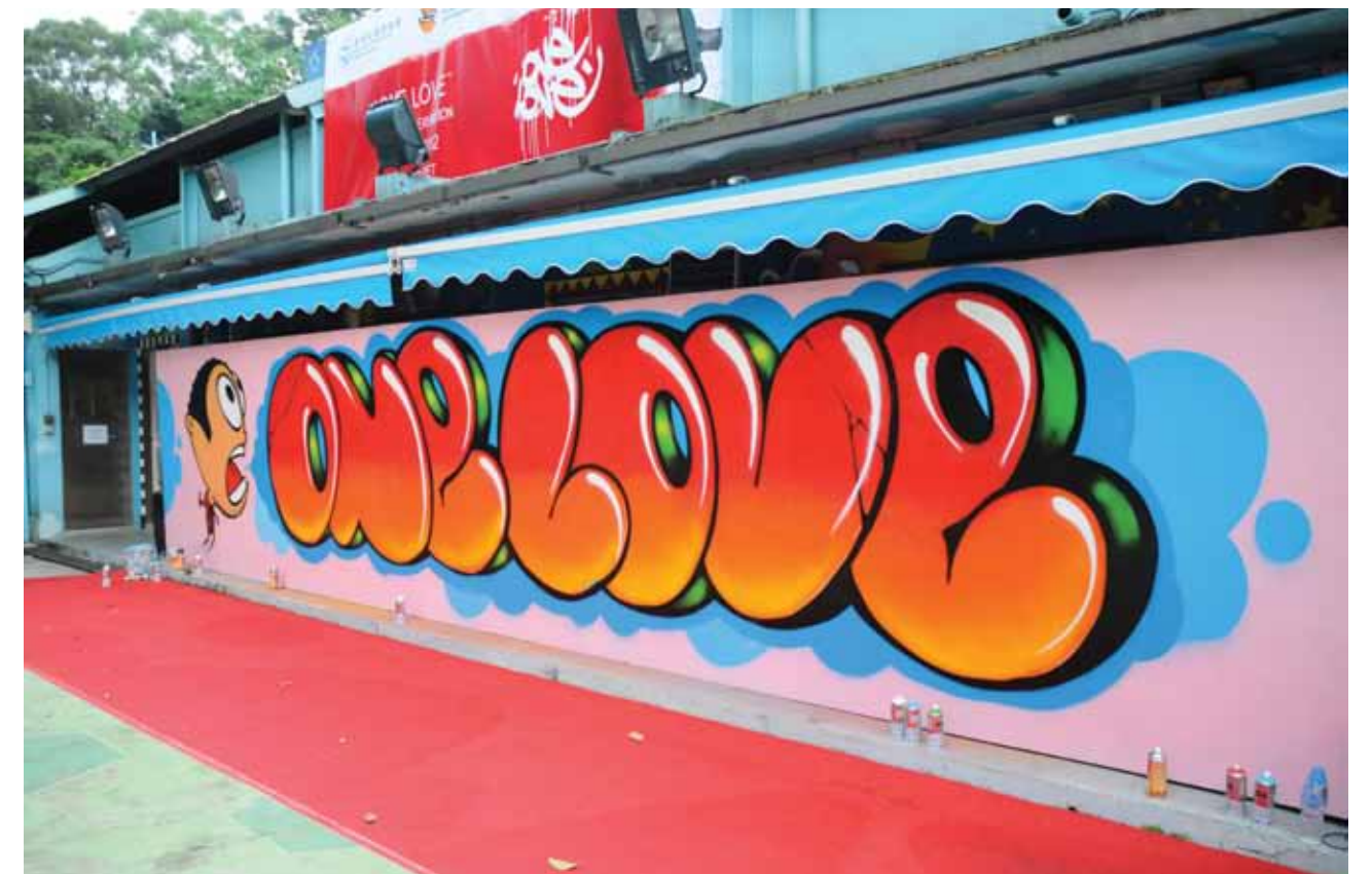
Fig. 14. One Love , TeenGuard Valley Crime Prevention Education Centre, Shatin, Hong Kong, 12 May 2012.

Although the number of commissioned works, workshops and events might be growing in one specific