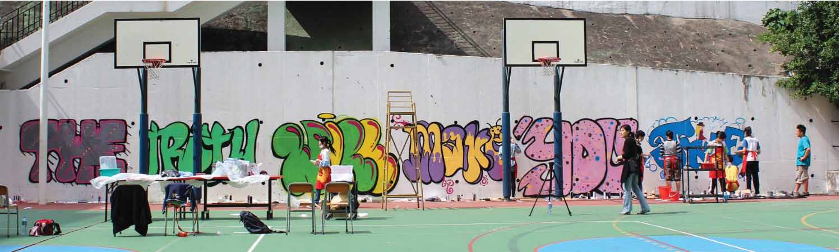
Fig. 12. SKH Lam Woo Memorial Secondary School, Kwai Chung, Hong Kong, 6 February 2013.