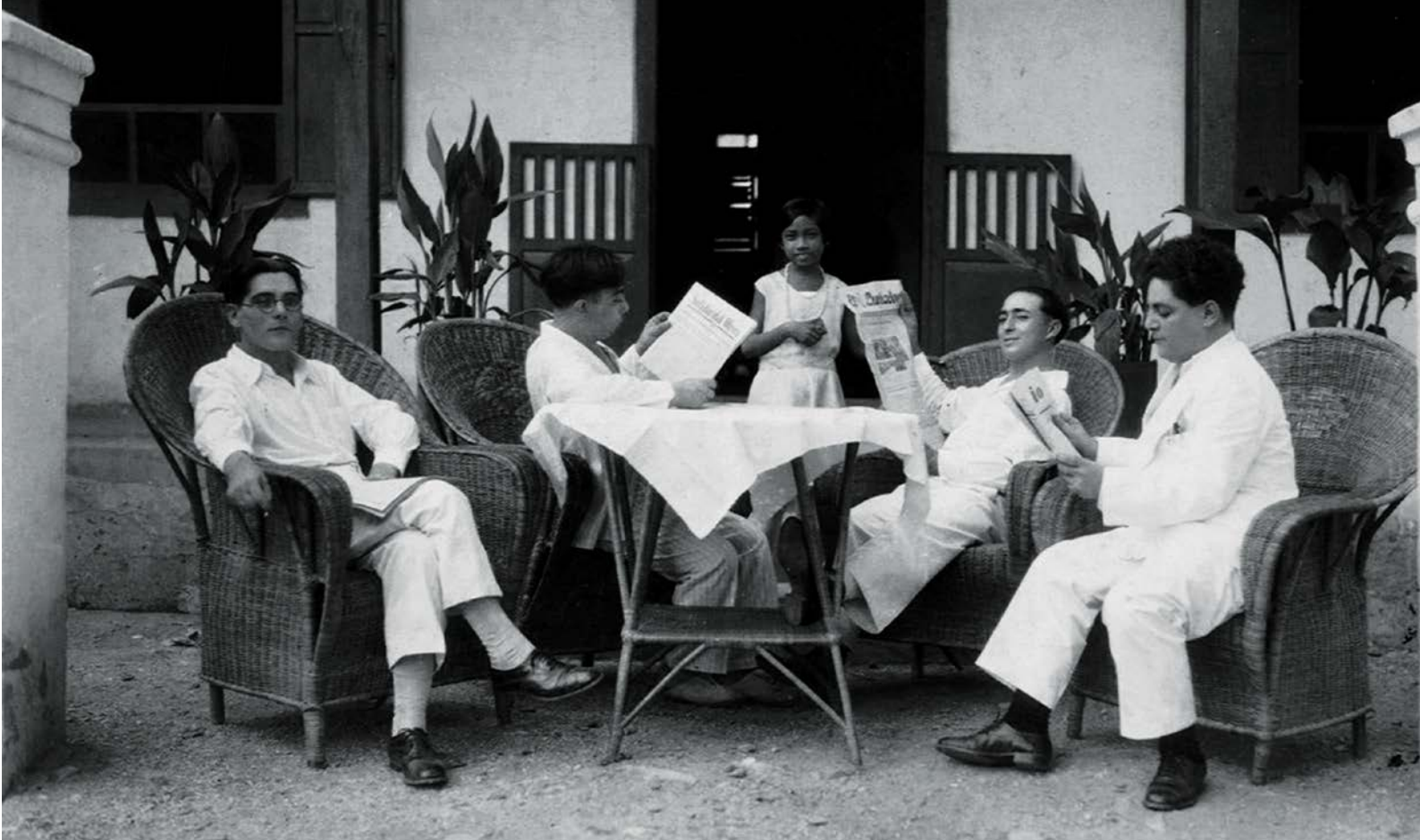
Morning reading at the residence and headquarters of the Aliança Libertária in Dili (Timor); “Deported anarchists in Dili (Timor) exhibit titles of Spanish newspapers (Solidaridad Obrera and others), with a Timorese girl in the center.” 1932. in Revista Blanca.

in 1927. By contrast, this article seeks to connect Portugal with colonial Timor through an examination of two groups of deportados dispatched to the half-island colony, the so-called “ deportados sociais ” (socials) of 1927, versus the “ deportados políticos ” (politicals) of 1931, as well as exposing their crimes and punishments set against the metropolitan context.