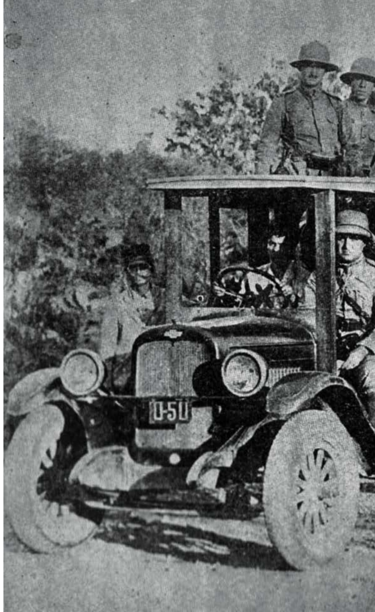
"O 'Bela-Kun' X legionário vermelho guiando sua 'camionete,' no exercício militar de guarnição"

Nevertheless, as Freitas (2007: 47) concedes, the young syndicalists pursued direct action committing the crimes that made the Legion notorious. According to an indictment of the Legião issued in the name of do Amaral by the Salazarist Estado Nova to justify its methods and the establishment of order, in 1924 alone