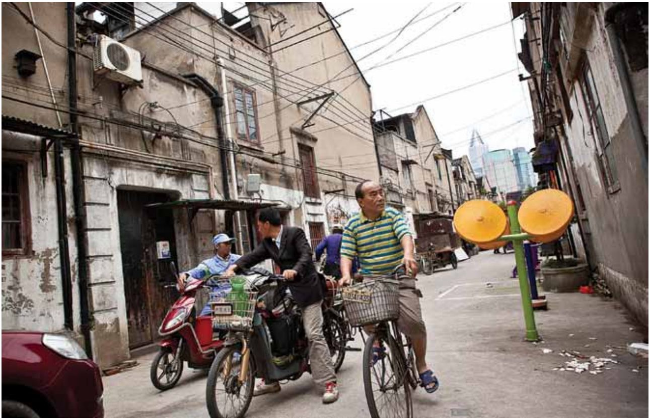
Figure 3: Alleys of a shikumen (the most popular style of the lilong houses) compound in Siwen Lane, one of Shanghai’s largest lane neighbourhoods housing at its height, 700 families. Located in the prime downtown area of Jing’An district, the compound has since been slowly demolished to make way for a museum and new residential and corporate buildings.

After the Chinese Communist Party (CCP) declared its victory over the Nationalist Party in 1949, the entire lilong housing stock was confiscated and re-distributed among the local residents and workers of varying political and income classes who were assigned into a single unit. These residents and workers would live there until the neighbourhoods were torn down in the decades to come. 8 The 200,000 lilong units were just adequate for three million residents in the 1930s, and were unable to accommodate eleven million residents during the initial stage of the experimental opening up and reform era of the early 1980s. The local government turned to the market to unburden itself of the public service of housing maintenance by offering private ownership to the original residents at a low cost, and to build more housing for the new