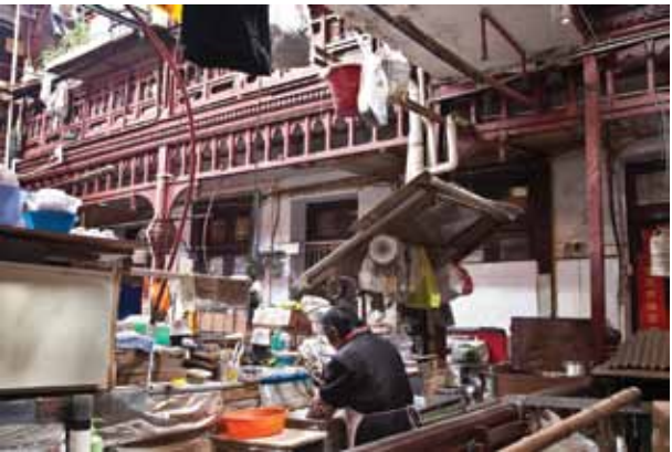
Figure 2: Cramped homes kitchens: An old resident cooks in a make-shift kitchen placed in the middle of a public corridor of an old apartment located blocks from Shanghai’s Bund. The building was a former office and warehouse operated by the British in the early 20 th century when Shanghai was divided into foreign and local concessions.

Since the first Opium War, Shanghai has been one of the most convenient points of access for foreign goods, and a site of export of China’s products. The British were the first to arrive in Shanghai in the mid-1840s, and, through Western-style urban planning, created a well-functioning city to accommodate the treaty port’s commercial activities. By way of the then newly-created ‘Land Regulations of 1845’, the British imposed new comprehensive planning policies upon the hitherto organically grown, medium-sized market town. 5 Due to Shanghai’s flat geography, a grid structure was conveniently imposed which became the basis of land division and property investment in the bounded territory called the International Settlement. Both