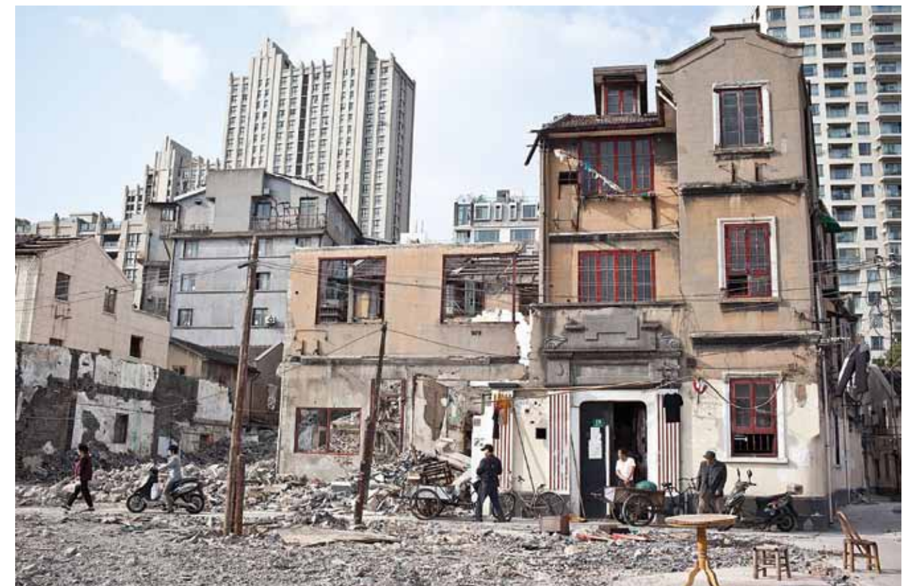
Figure 5: Shikumen demolition: A shikumen house left standing amidst a mostly demolished lilong compound in a prime area near Xintiandi.

Finally, in order to sustain such activities, Jacobs argues, business must play a role. This is the point where