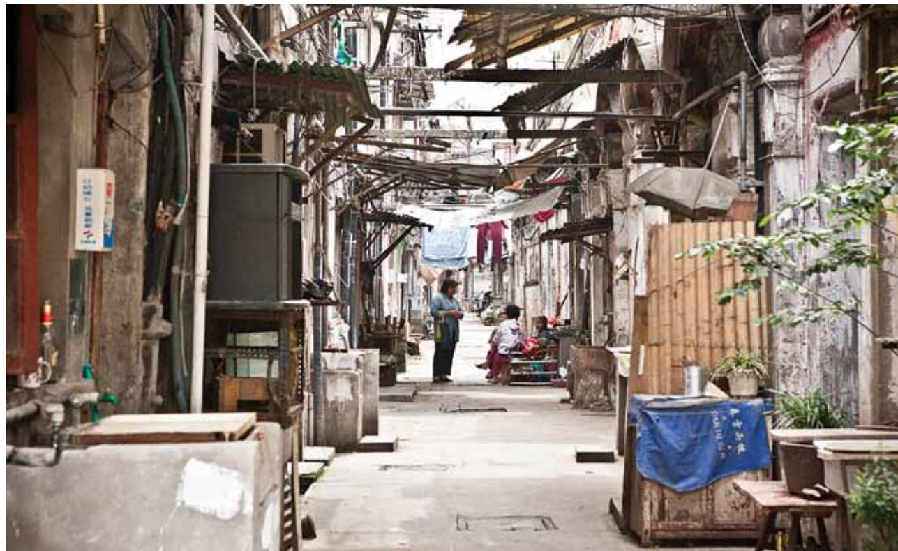
Figure 4: Shikumen alley gossip: Residents gossip in the shikumen lanes of Siwen Lane compound, a key artery of community interaction and public household activity.

program. Instead, they rent their rooms to outside tenants, who would then renovate (though often just re-decorate) the apartment to fit the tenants' needs (or taste), and once the lease is over, the renovated room would then return to being as the asset of the original resident. This strategy may sound harmless on the surface, but if we look more carefully, it leads to a voluntary form of gentrification that maintains no sense of historic underpinning, let alone a sense of community belonging. In other words, a visitor may encounter a situation in which he or she is in a centrally located alleyway house neighbourhood, whose occupants are mainly expatriates and non-locals. The visitor may mistake this particular neighbourhood for an example of traditional Shanghainese life, but the sense of history no longer exists, as there is no one to educate that visitor on the historical significance of the place. In Shanghai, where income disparity is wide, generally it is only expatriates or the upper middleclass wishing to claim a sense of 'cultural capital' 23 who can afford to live in a heritage structure. Frequently, they cosmetically redecorate the houses in a manner that attempts to capture their romanticised imaginings of erstwhile Shanghainese lane life. 24